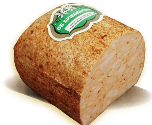
(224) Chicken Fillet with Sambal

This delicious chicken fillet gets an aromatic and pithy taste, through the addition of curry, made from a mixture of Asian spices, such as coriander, pepper, cumin, chilli peppers.