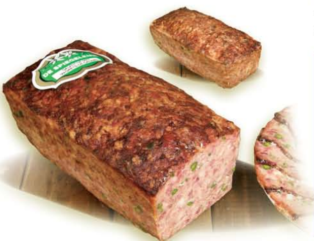
(384) Festive Duck Loaf

This chicken fillet is only available during April and May.