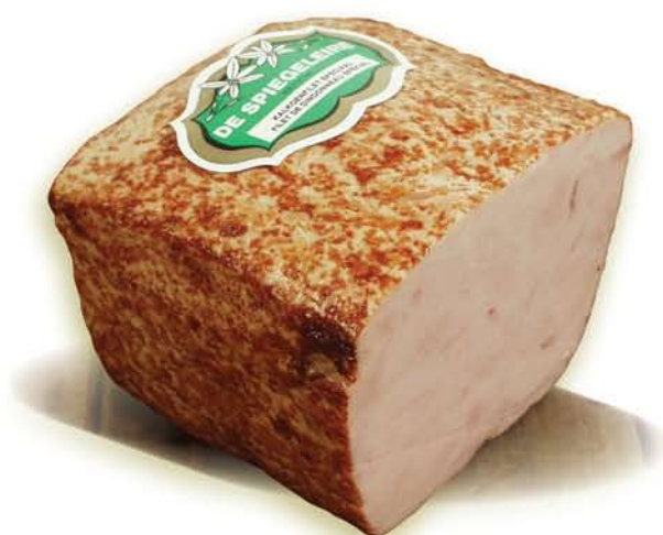
(201) Turkey Fillet Special

The filleted chicken breast meat is marinated beforehand. These fillets are pressed into a mould and cooked in the oven. Just before packaging the chicken fillet is baked golden-brown. This makes the chicken fillet juicy, and full of taste, and provides the characteristic brown crust, that just belongs to chicken.