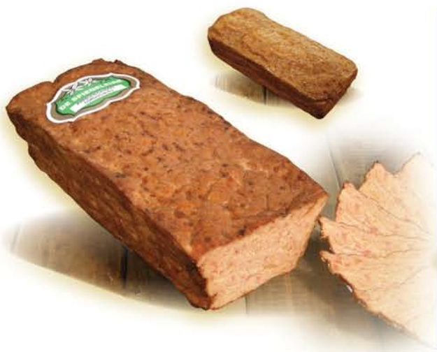
(255) Chicken Loaf Cordon Bleu

Packaging code (264) Weight per piece: 1,700 Kg (1 p. / box)