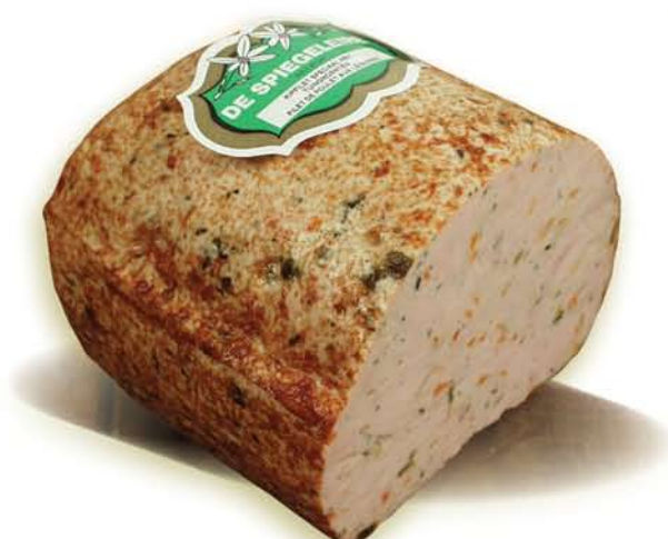
(203) Chicken Fillet with garden vegetables

Packaging code (250) Weight per piece: 1,500 Kg (4 p. / box)