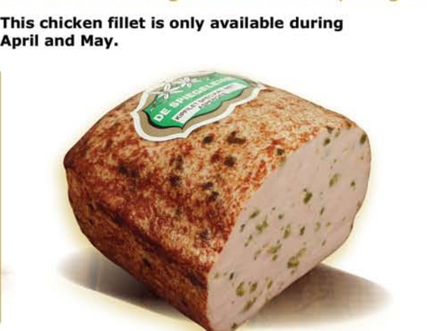
(223) Chicken Fillet with Asparagus

This authentic product subtly blends duck with pork shoulder, freshly minced and appetisingly topped with smoked and dried duck fillet and all delicately seasoned with white port.