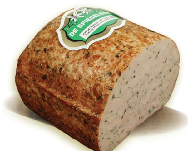
(204) Chicken Fillet with garden herbs

During the preparation process deliciously fresh, young garden vegetables (such as carrots, leeks, cabbage....) are added.