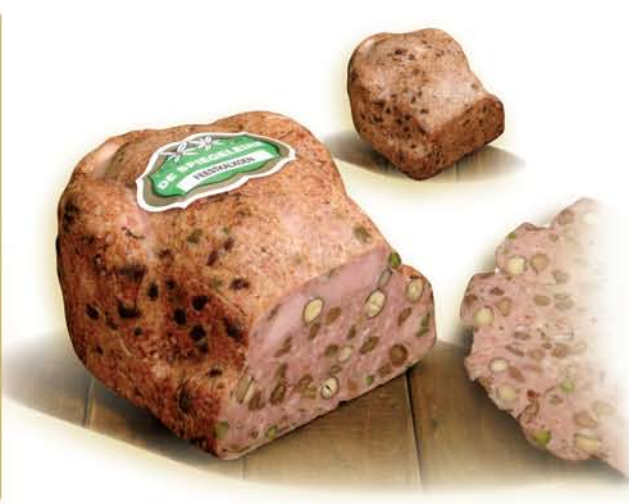
(258) Festive Turkey

The addition of ham and cheese gives chicken loaf a hearty, full flavour. This chicken loaf is also visually attractive due to the refreshing range of colours.