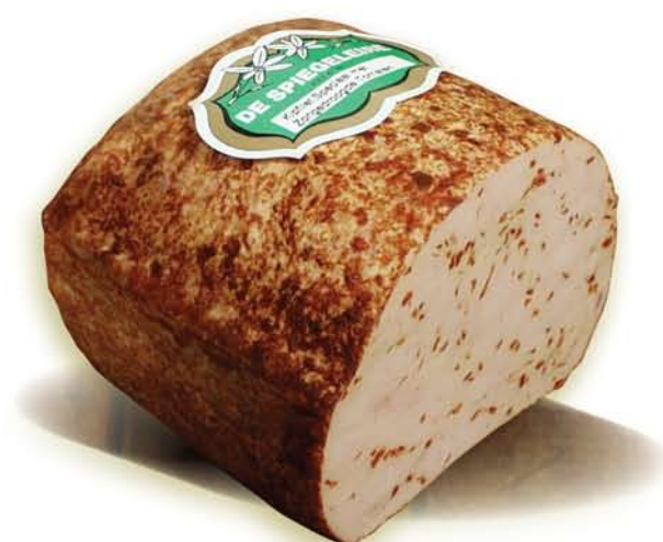
(226) Chicken Fillet with Sundried tomatoes

The addition of sambal relish gives this chicken fillet a spicy character.