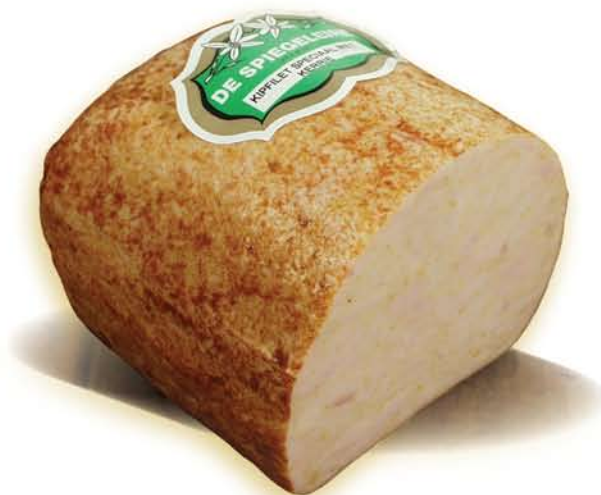
(221) Chicken Fillet with Curry

For this range of poultry concerns a minimum order of 75 Kg