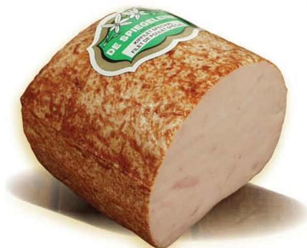
(200) Chicken Fillet Special

Our range of poultry require a minimum order period of 3 days