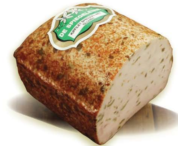
(227) Chicken Fillet with Olives

The addition of sun-dried tomatoes gives this chicken breast a Mediterranean character.